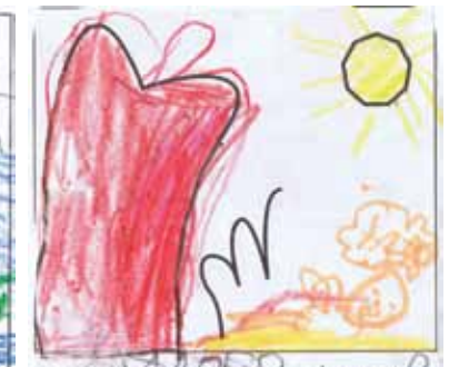
First Name: Last Initial: P Age: City/Town: Innisfil

Using the shapes above, create a colourful picture. Be imaginative!