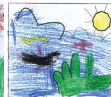
First Name: Last Initial: Age: City/Town: Orillia