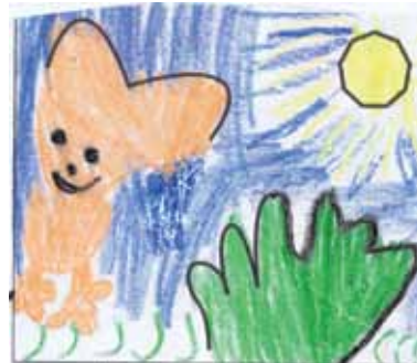
First Name: Liam Last Initial: M Age: 7 City/Town: Barrie