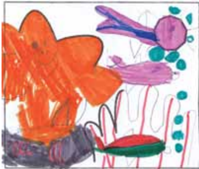
First Name: Shay Last Initial: Age: 7 City/Town: Orillia

What a tremendous response we received this month! Thank you everyone for your wonderful drawings. We think what you do with our squiggles is simply awesome! There were so many of you this month we had to do a draw. If you don't see your art here, check out www.kidscoop.ca as we have put your artwork up online. Can't wait to see what you do this month!