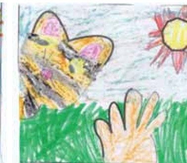
First Name: Last Initial: Age: City/Town: Innisfil