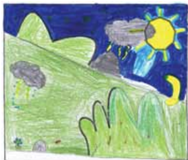
First Name: Tasmiat Last Initial: Age: 7 City/Town: Orillia