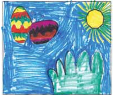
First Name: Keir Last Initial: Age: 6 City/Town: Orillia