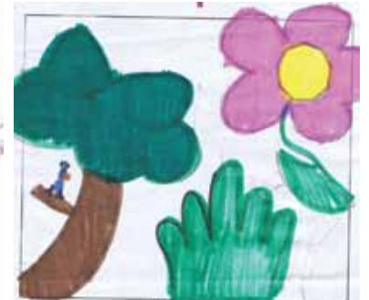
First Name: Alexa Last Initial: R Age: 9 City/Town: Collingwood