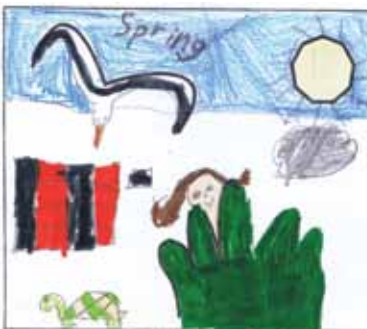
First Name: Lizra Last Initial: Age: 6 City/Town: Orillia