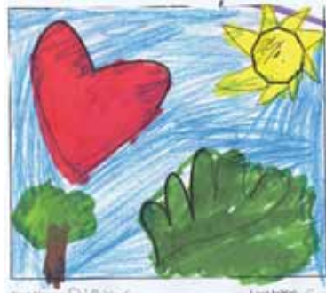
First Name: Dickie Last Initial: Age: 7 City/Town: Innisfil