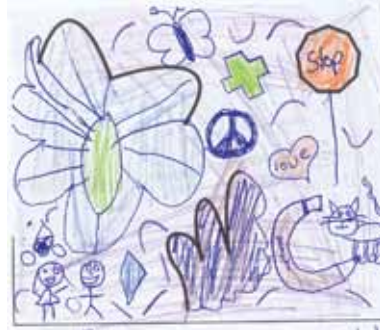
First Name: Aubrey Last Initial: W Age: 10 yrs City/Town: Gravenhurst