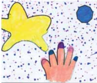
First Name: Byrnn Last Initial: C Age: 8 City/Town: Orillia