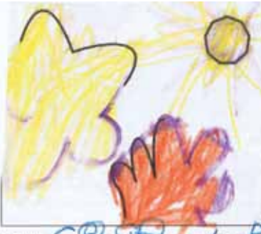
First Name: Last Initial: Age: City/Town: Innisfil