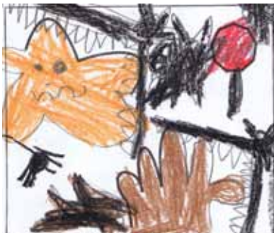
First Name: Evanna Last Initial: Age: 6 City/Town: Orillia